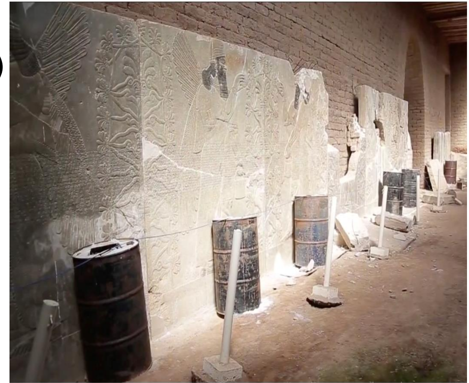
Nimrud, Northwest Palace, barrel bombs arranged in front of relief panels (still image from video released by ISIL on April 11, 2015)