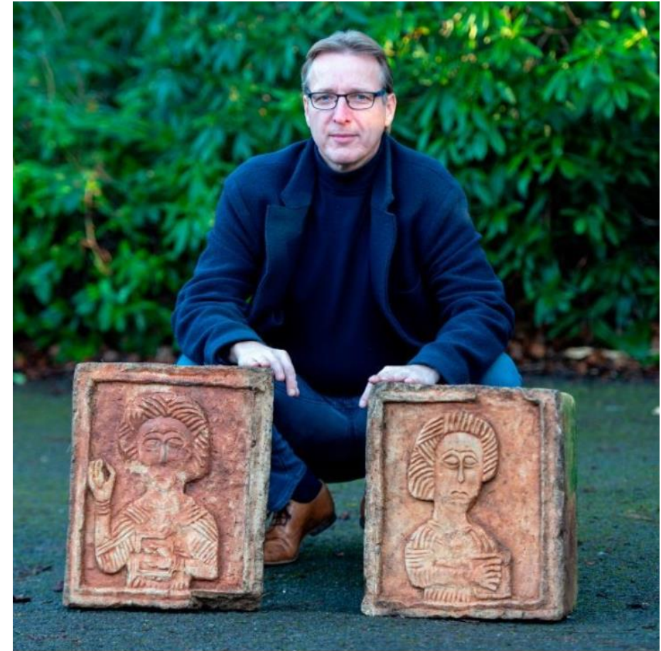
Dutch art detective Arthur Brand.