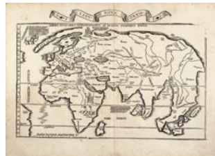
Wood, Paper & Canvas