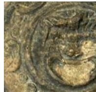
Ceramics, Metals & Alloys