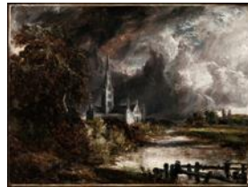
Paints & Inks