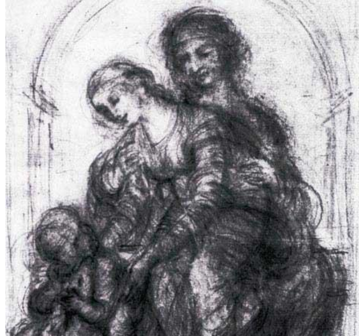
Madonna and Child with St. Anne and a lamb