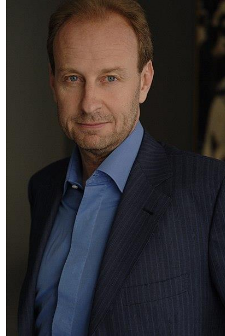
Yves Bouvier