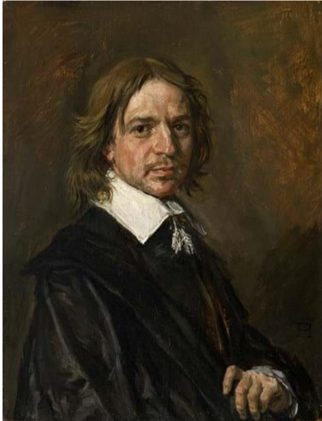
Portrait of an Unknown Man Frans Hals (?)