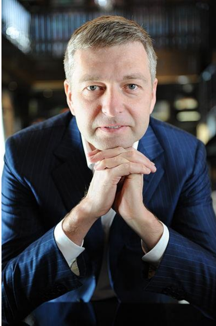
Dmitry Rybolovlev